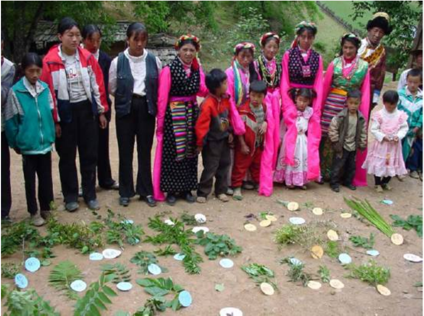
Fig. 1. In 1 h, Tibetan villagers in northwest Yunnan collected more than 80 species of local plants used as medicines, food, fiber, etc. These have been used for generations and are classified within the village's epistemological and knowledge systems.

responsibility. Pluralism in ecology, therefore, may contribute to the preservation of sacred beliefs and the conservation of landscapes.