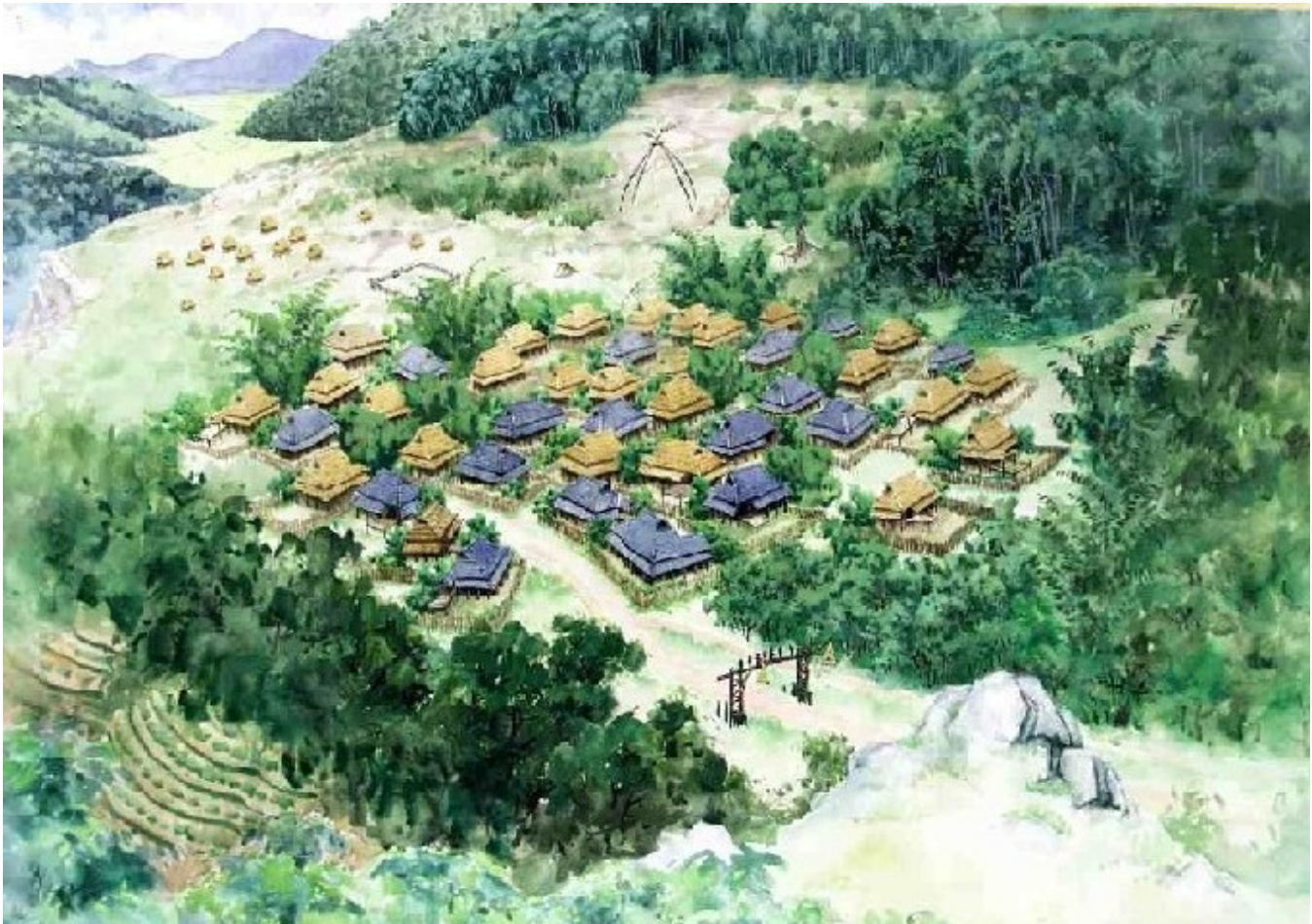
Fig. 3. The physical layout of a Hani village reflects the community's beliefs. Areas for human habitation are alongside outer areas of forest preserved for the souls of departed ancestors and gods. The village gate in the foreground separates society and nature, while the common house, in the center behind the gate, allows communication among the different facets. Illustration by Yang Jiankun, Kunming Institute of Botany, Kunming, China.