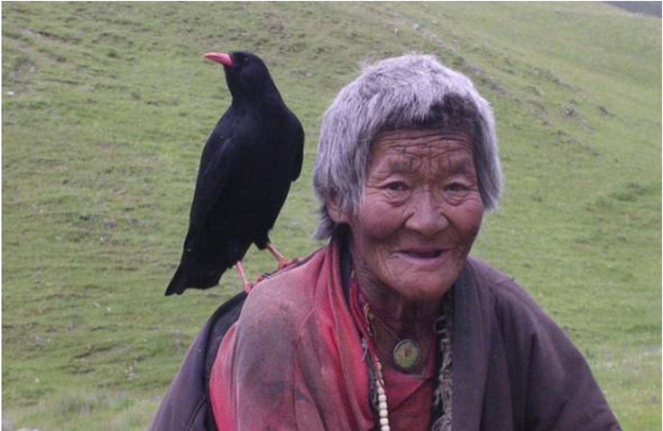
Fig. 4. A chough sits on a Tibetan widow's shoulder. The local people believe that the bird is the reincarnation of the woman's daughter. [ Erratum ]

Recently, however, policy changes aimed at improving rural wealth by increasing the quality and quantity of livestock have encouraged sedentarization. Fencing programs have tried to limit the seasonal use of rangelands and instead have encouraged the use of silage and controlled breeding. In addition, the imposition of burning bans has removed a traditional method by which herders used to maintain local grasslands. These innovations have not been very successful in Yunnan, where many fences are neglected, supposedly protected pastures are illegally grazed, and attempts to encourage farmers to increase livestock numbers are leading to concerns about overgrazing and weed infestation in some alpine rangelands. These problems are obvious, and officials with the Forest Management and Animal Husbandry Bureau are now showing a