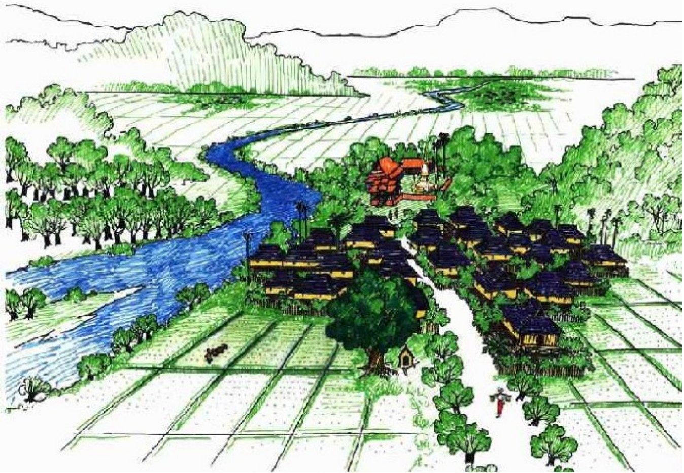
Fig. 2. A landscape of a lowland Dai village in Xishuangbanna. The drawing shows a fuelwood forest of Cassia siamea trees on the left, a sacred forest or “holy hill” on the right, a temple yard garden in the background, and a home garden with residential areas and paddy fields in the foreground. Illustration by Yang Jiankun, Kunming Institute of Botany, Kunming, China.

management, Banmen , who were responsible for distributing water and organizing the communal building and maintenance of dams, channels, and fishponds. Cooperation between the people of the uplands and those of the lowlands for the use of streams was encouraged and maintained through the intermarriage of people from neighboring regions, e.g., people in present-day Xishuangbanna and those in northern Thailand, who shared similar environments and religious beliefs (Xu and Salas 2003).